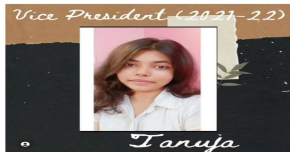
Vice President (2021-22)