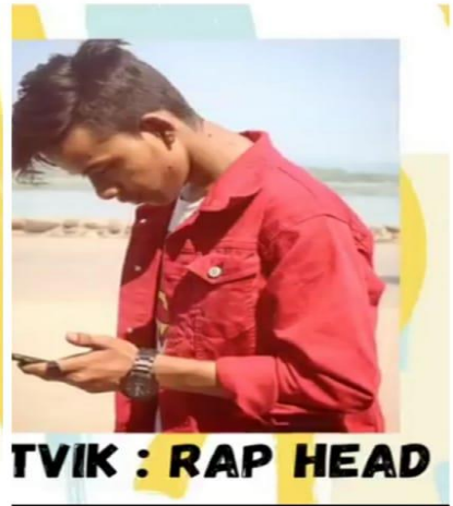
TVIK : RAP HEAD