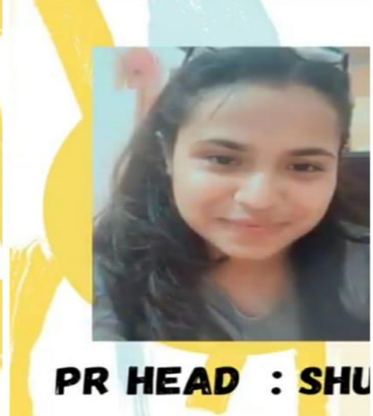
PR HEAD : SHU